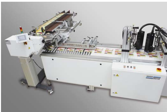
Mailline, the perfect versatile finishing line

All Hugo Beck feeders are equipped with servo motors and are moveable so that they can be placed as autonomous units at any position of the manufacturing line or at any other machine.